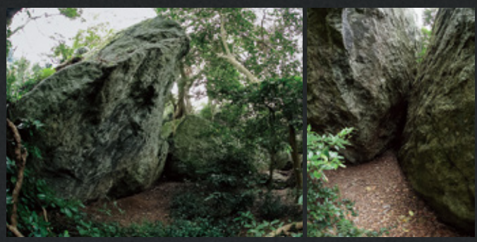
Site 7 (L) and Site 5 (R). Behind the main hall of Okitsu-miya is a group of massive rocks, some towering over 10 m in height. The ritual sites of Site 7 are located in the shadow of these rocks, while those of Site 5 are found both in the shadow of the rocks and out in the exposed areas in front of the rocks.

In 1954 an excavation survey on Okinoshima uncovered 22 ancient and large-scale ritual sites that had been used over a 500-year period from the late 4th to 9th centuries. More than 80,000 votive offerings were discovered at these sites. It was the long-standing taboo on travel to the island that had helped to ensure that the sites of ancient state rituals remained miraculously untouched over the course of the centuries.